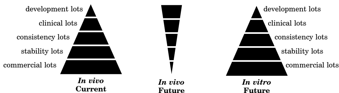
Figure 1: Animal consumption for quality control of vaccines

Currently, the highest proportion of animals are used for quality control of commercial lots. In the future, this will probably change to the highest proportion of animals being used for development lots (Omer Van Opstal, personal communication).